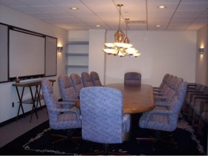
Suites Conference Room